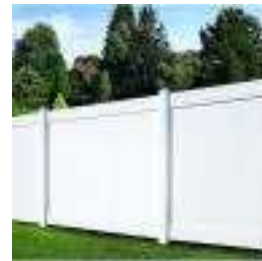
White vinyl fencing

Approved storm door – white or beige – available at Lowe's/Home Depot