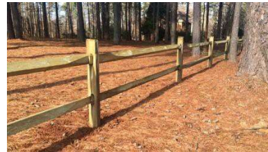
Split rail fencing