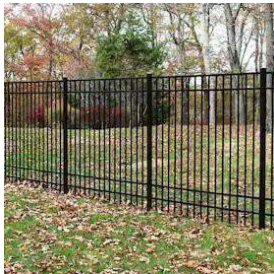
Black aluminum fencing (see RR pocket park)