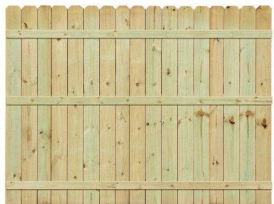
Cedar stockade fencing