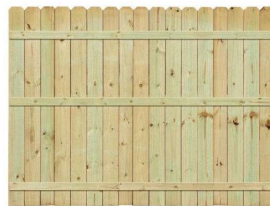
Cedar stockade fencing