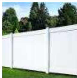
White vinyl fencing