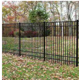
Black aluminum fencing (see RR pocket park)