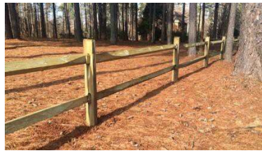
Split rail fencing